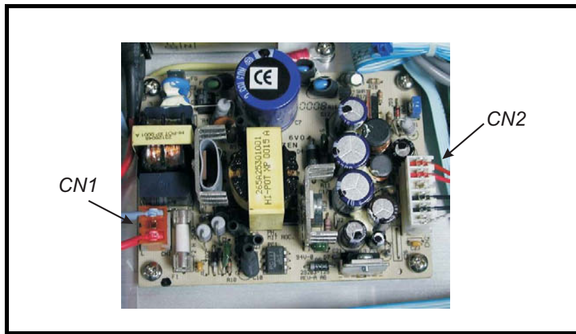
FIGURE 1. Old Power Supply