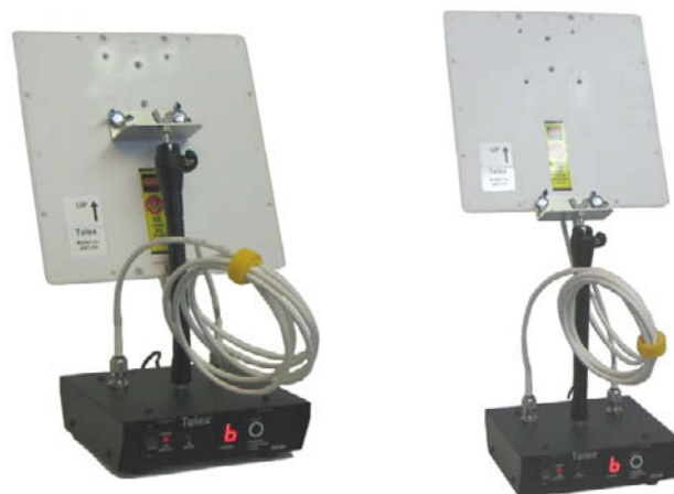
Figure 1 XO-AP and Panel Antenna